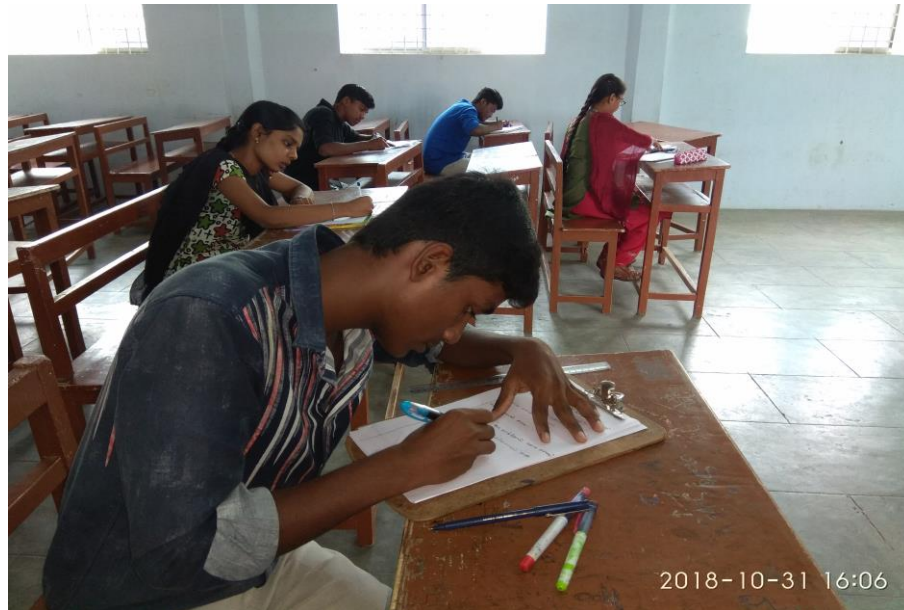
First B.E year students participated Essay Writing about National Unity on National Unity Day (Rashtriya Ekta Diwas)