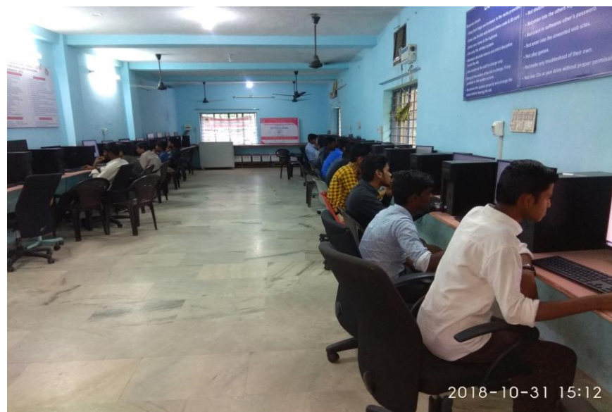
First B.E year students participated Online Quiz Competition about National Unity on National Unity Day (Rashtriya Ekta Diwas)